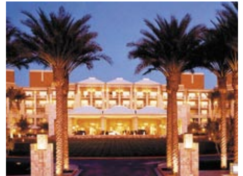
Desert Ridge Marriott

Desert Ridge Marriott Resort & Spa at 950 rooms is the largest hotel in Arizona. The $300 million resort, completed in 2002, is home to 36 holes of championship golf, 8 tennis courts, a 28,000 square-foot spa, 10 food-and-beverage outlets, a fitness center and swimming pools with "lazy river".